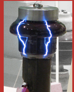
High voltage test

ATTrack Shield is an optically clear coating with 5 to 20 nanometers of thickness that chemically bonds to our ceramic third rail insulators. The result is the creation of a durable seal that resists contaminants, abrasion, and scratching.