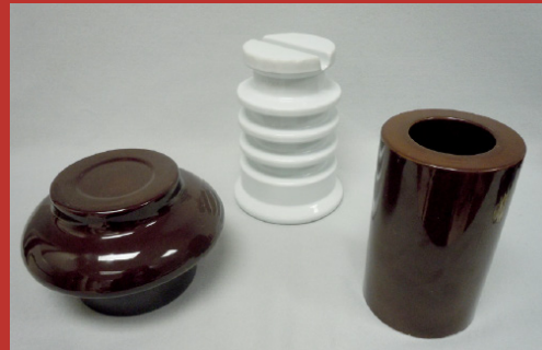
Available in any size and type